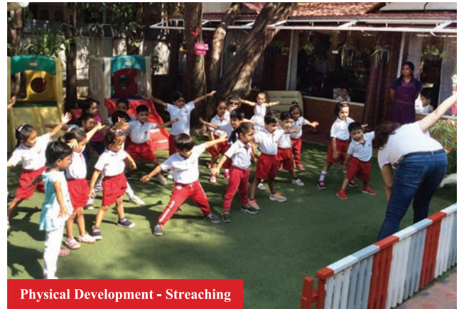
Physical Development - Streaching

We support the principle that “education is enhanced by the creation of affirmative, responsive environments that promote a sense of belonging, safety, self-worth and whole growth for every child”. Our thoughtfully curated programme at Vivero was one such initiative created to provide children an opportunity to ensure personal, social and emotional skill development, familiarize them with flow of the day; participate in indoor integrated group play; bond with peers during circle time; revisit concepts integrated with creative explorations; and engage in structured outdoor play. Our facilitators at Vivero, planned meaningful learning engagements which helped children settle in the new classrooms; interact with their teachers and friends. The program also offered a variety of play-based activities to help them build on their communication and critical thinking skills. It certainly helped create a positive school environment where learners are supported to develop into knowledgeable and caring young people who help to create a better and more peaceful world through intercultural understanding and respect.