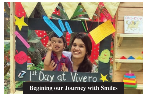
Beginning our Journey with Smiles