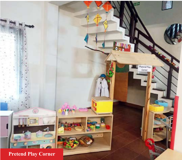
Pretend Play Corner