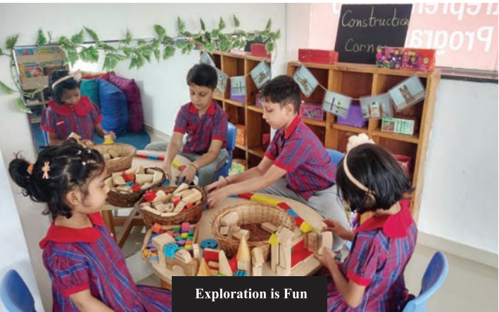
Exploration is Fun