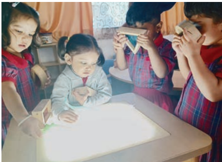
Collaborating at the Light Table

The Atelier of Light is a place to investigate the use of light in various forms to stimulate children's creativity. The use of light in the realm of early childhood education was introduced by Loris Malaguzzi, the founder of the Reggio Emilia Approach. This approach gives freedom to children to choose their own learning activities, problem solve, cooperate, build on their critical thinking skills and social abilities. The material displayed is a mix of open-ended, recyclable and ready-made, laid out aesthetically, always available and accessible for the children. Learners conduct research, experiments and are given the freedom to explore light, that provides opportunities to learn about concepts of science, namely reflection, refraction. The light Atelier is also used as a learning space to set up provocations as well as introducing the concept of size, patterns, colour, textures etc. Our facilitators observe the way each child manipulates; combines the materials; collects evidence about their interests, learning and development. This supports the process of documentation, of making the learning and relationships of children, teachers and parents visible.