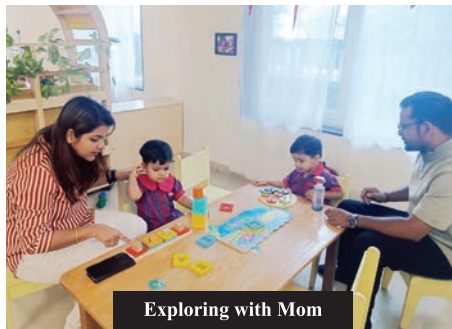
Exploring with Mom