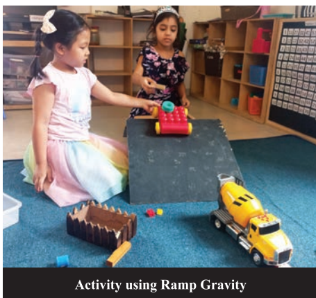
Activity using Ramp Gravity

Children explored a variety of open ended materials imaginatively to come up with unique creations which they happily carried back home.