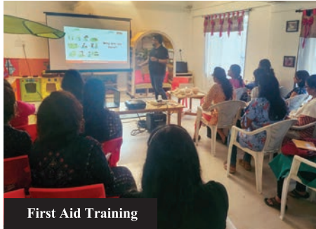
First Aid Training