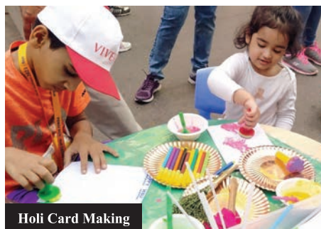
Holi Card Making