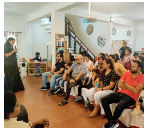
Addressing Parent Queries