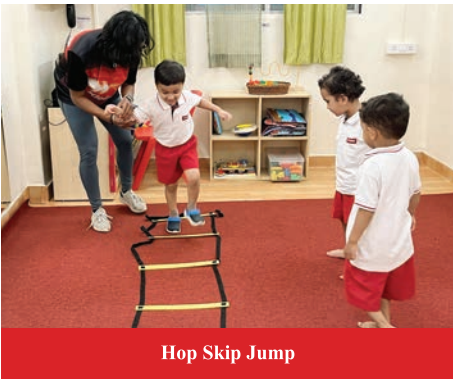
Hop Skip Jump