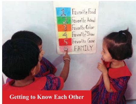
Getting to Know Each Other