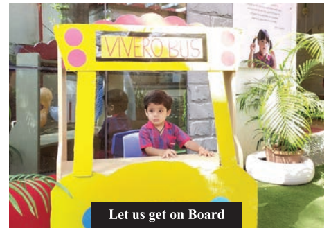
Let us get on Board