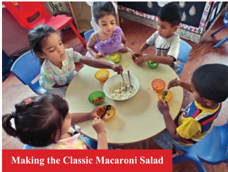
Making the Classic Macaroni Salad