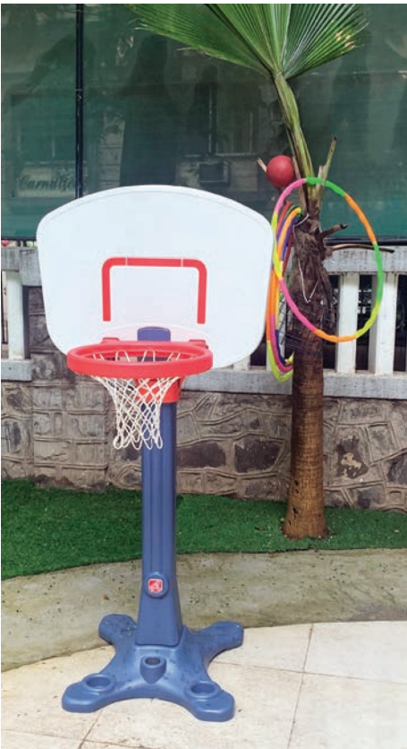
Aim a Basket

Vivero Kalyaninagar has indeed unfolded another look, newly painted along with blossoming plants to give it a comfortable feel. We have enriched the entry walk-way with a green turf for our children and parents. New outside gear has added to an elevated degree of fervour among our children, particularly the Chef House where they go through hours of enacting as cooks over the counter and don't have any desire to return home! The basketball stand has been a fascination for our K1 and K2 children. We have also added tricycles and mini scooters for our children to explore during outdoor play.