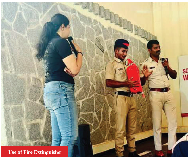
Use of Fire Extinguisher

Our support staff is also trained on the Use of Fire Extinguishers that can be used in case of emergency. The session ended with our diligent and persevering participating in a quiz on challenging issues and to plan their daily work routine.