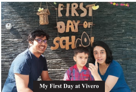
My First Day at Vivero