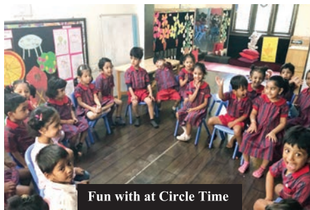
Fun with at Circle Time