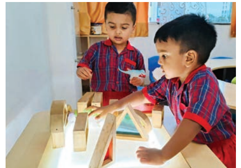
Exploring Colour Blocks