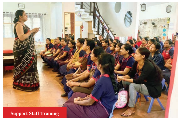
Support Staff Training