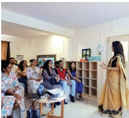
Power Point Presentations

The Parent Orientation is an integral feature of our endeavour to maintain clear communication with all parents. To provide an in-depth insight into our pedagogy for the next academic level. The objective is to set clear expectations thereby strengthening our efforts as we work with children to settle and achieve their learning goals. The Parent Orientation was designed to assist parents arrive at a understanding of the learning goals set for the academic year 2023-24. We conducted our Parent Orientation Program on Saturday 3rd June 2023. Parents attended it at all our centres as we embarked on our learning journey for the new academic year.