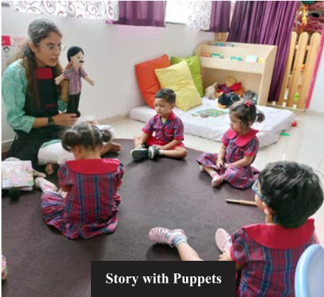
Story with Puppets