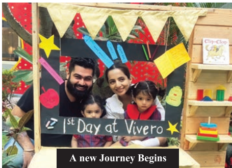
A new Journey Begins

The focus and a sense of belonging also comes from an environment full of new possibilities. Often referred to as the “preschool period” where children’s language, social emotional and cognitive skills are rapidly expanding. We planned meaningful learning engagements with an aim to calm anxious children and facilitate settling in through play. Hands on activities and creative explorations enabled them connect to ideas; make sense of the new learning spaces; as well as to use and develop their imagination and creativity. It was wonderful to see them engage in exploring the outdoors, table top play, circle time, singing rhymes, and interacting with peers. The many successes we had, continues with a strong partnership in which the school and community work together to create supportive and inclusive culture of learning. Our vibrant team of facilitators are all geared up for yet another exciting academic year!