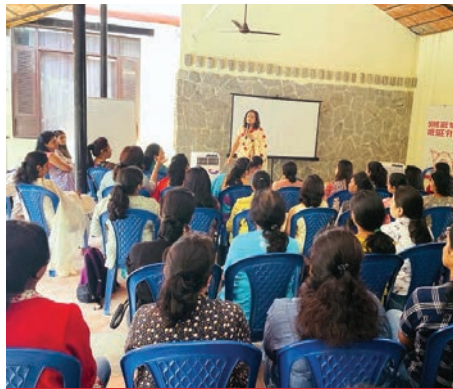
Following Code of Conduct