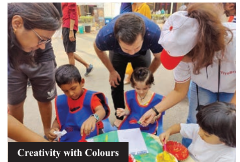
Creativity with Colours