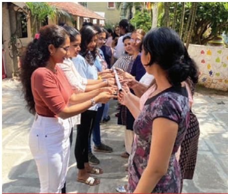
Collaboration Makes Things Happen