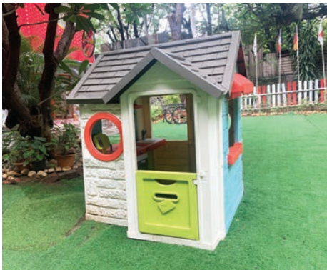
The Doll House