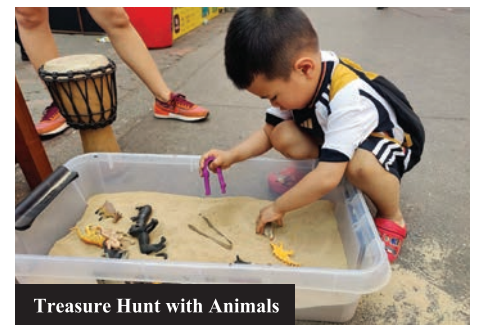
Treasure Hunt with Animals