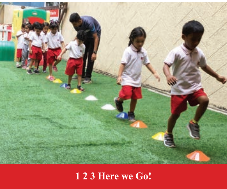
1 2 3 Here we Go!

This program is held once a week. It incorporates a variety of engaging exercises, and games like handball, football, basketball, striking sports, field sports, relay races and music and dance based workouts with yoga and cool downs.