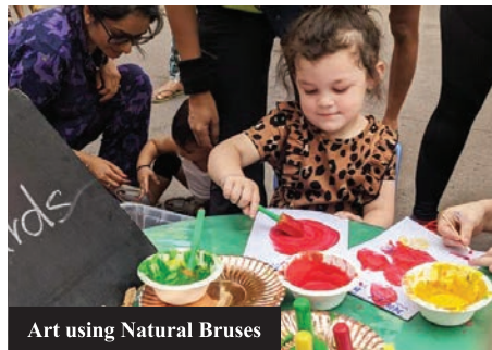
Art using Natural Bruses

Scooping shells and other open-ended materials like bottle caps, pebbles etc using a strainer enhanced eye hand coordination. Children demonstrated their logical reasoning by participating in Brain teaser colour match activity. Animal treasure hunt with sand enhanced the sensory experience of the young preschoolers. STEAM experiences were the highlight which saw children engaged in building architectural structures using wooden blocks, straws, toilet paper rolls, popsicle sticks etc to showcase their creativity. These engagements planned were 'Reggio' inspired that helped making connections with the philosophy we follow at Vivero. The environment was stimulating and enhanced 21st Century learning experiences. We were able to create some beautiful moments and rich experiences for all the children and our stake holders.