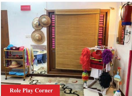
Role Play Corner

Because today's children are tomorrow's leaders, it is also important for them to learn about how to protect the environment. Implementing school-wide projects is an educational and fun way for children to be proactive in terms of the environment.