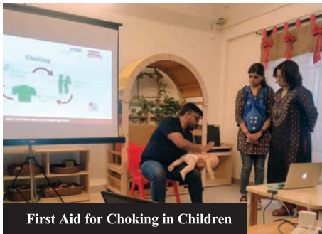
First Aid for Choking in Children