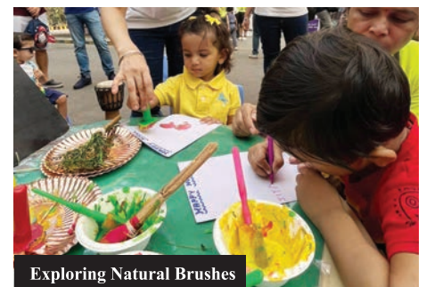
Exploring Natural Brushes