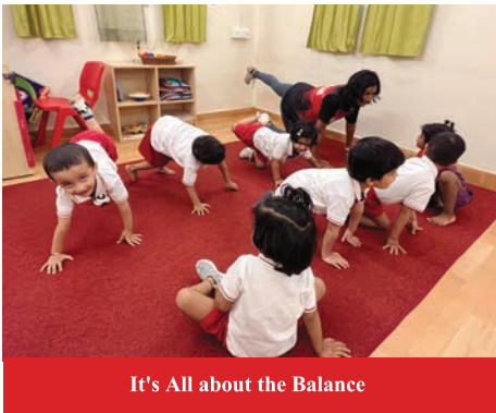
It's All about the Balance