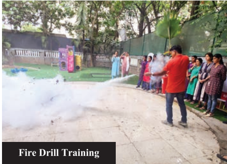
Fire Drill Training