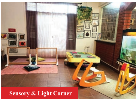
Sensory & Light Corner