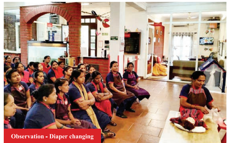
Observation - Diaper changing