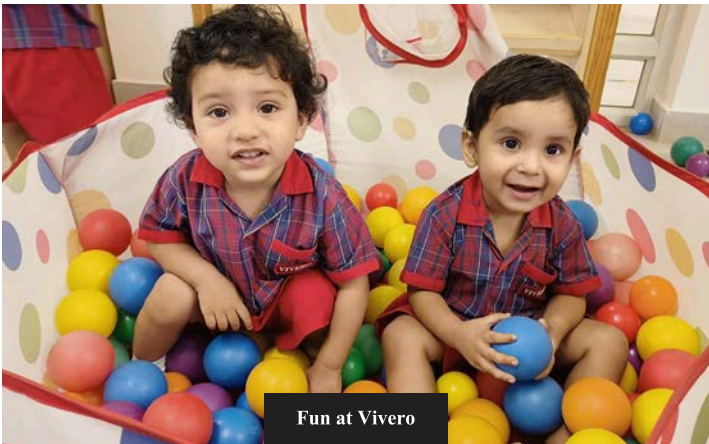
Fun at Vivero