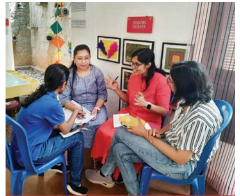
Teamwork is the Key

Hence it is imperative that teachers receive a complex understanding of early child development and learning methodologies to provide rich, meaningful educational experiences to all children. The periodic Academic Training and ongoing Professional Development Workshops are designed to help them in the implementation of our high-quality pre-school programs. The