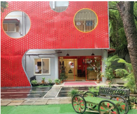
Warm and Welcoming Entrance